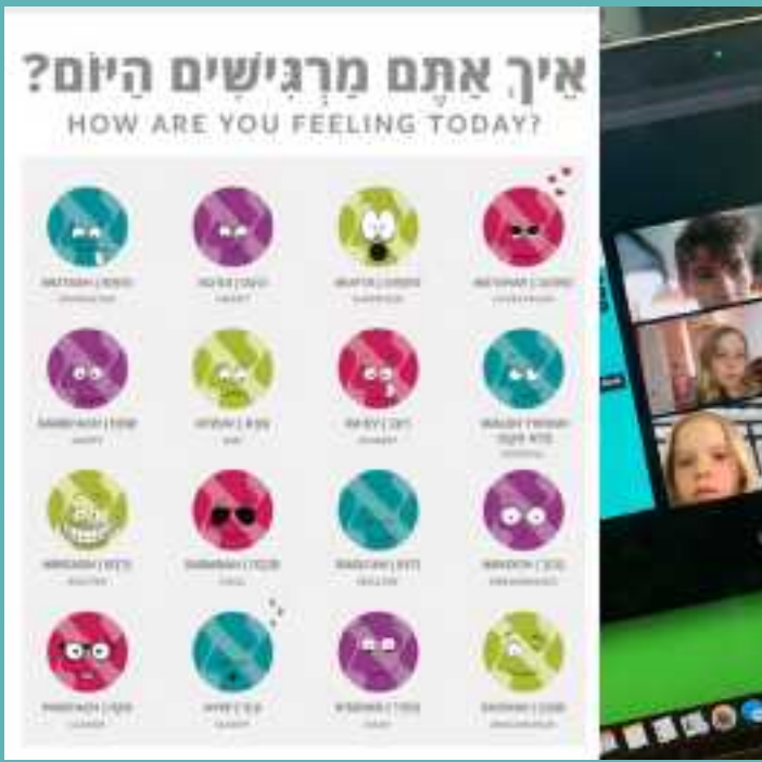
5th grade checks in with how they are feeling.