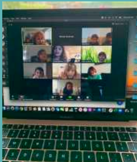
Third grade celebrates Israel