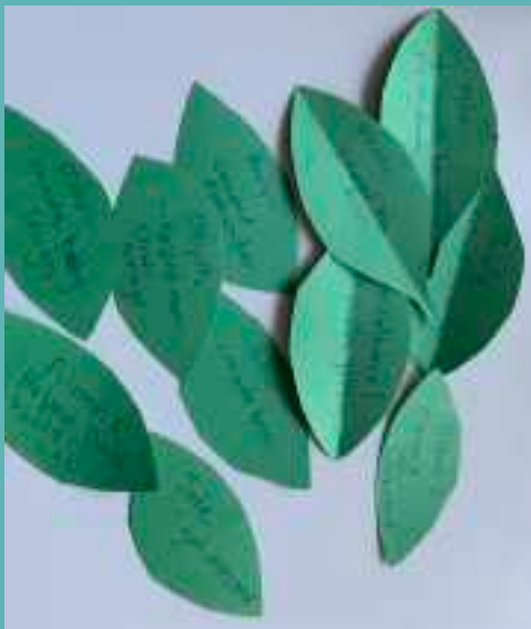
Leaves of mitzvot to be added to the Mitzvah tree